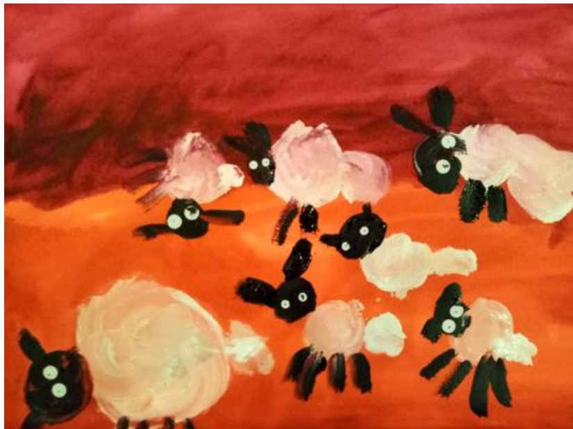
Fig.3 Aesthetic Education

Influenced by the traditional aesthetic education, some minority colleges and universities overemphasize the teaching of professional knowledge when they carry out aesthetic education, which is highly theoretical and mainly based on academic content. Moreover, the teaching method is single, and only relies on the teachers in the classroom, which leads to students' lack of interest, and the teaching content can not keep up with the pace of the times, relatively backward, and students' aesthetic There is a deviation, resulting in low interest in learning. For example, in the appreciation of Chinese painting, the teacher didn't consider the practical application, mainly teaching the application of elements, the collocation of scenery and so on, or limited to the superficial scope of appreciating works of art. The students think that the reference is not high and the practicability is not strong, so the interest of learning is low, and the teaching effect deviates from the goal [4].