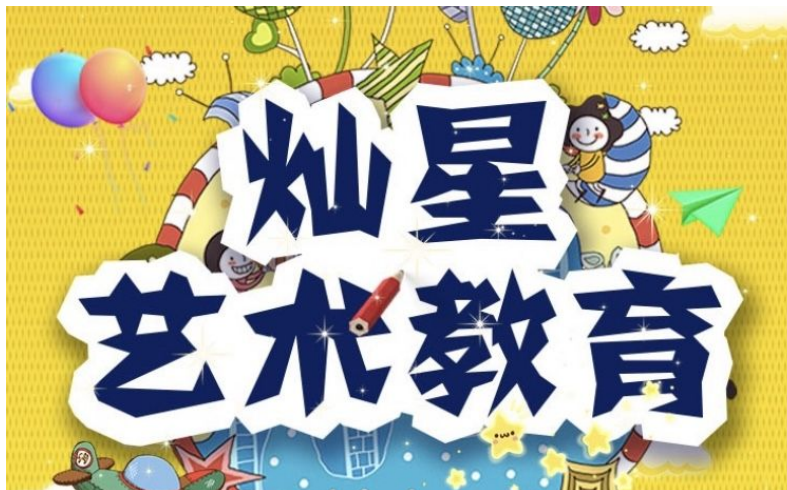
Fig.1 Art Education

It is an important work in the process of college education to pay attention to the cultivation of College Students' comprehensive quality. As a basic course for the implementation of college quality education, aesthetics can make full use of aesthetics to improve the overall quality of college students, cultivate their excellent aesthetic taste, broaden their horizons, help them better accept modern civilization and enhance their competitiveness. Colleges and universities in ethnic minority areas should also respond to the policies of the motherland and cultivate talents for all-round development. They should not only master natural science knowledge, but also have excellent humanistic quality.